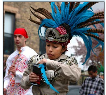
Aztec dancer at the Minneapolis May Day Parade.

The coalition brings together funders ranging from small grassroots operations to large foundations with substantial endowments, as well as both conservative and progressive funders. In this way, Solidarity MN provides an important new vehicle and entry point into the philanthropic ecosystem.