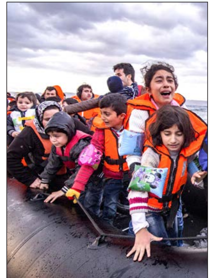
Syrian refugees on an overloaded dinghy arrive from Turkey to Molyvos, Lesbos.

The GWBF’s grantmaking strategies support an expanded notion of “well-being” that exceeds the traditional basic needs of shelter, employment, and health.