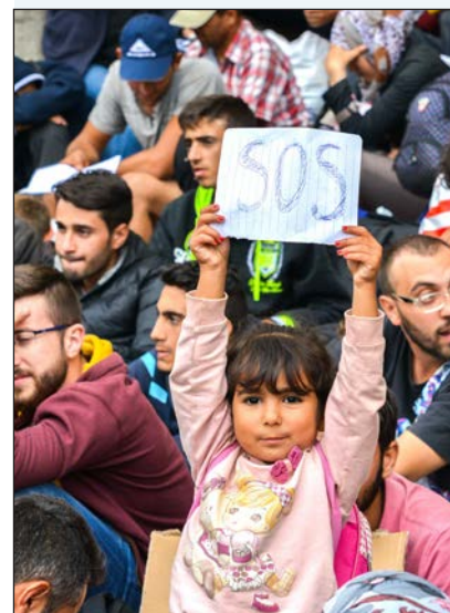
Refugees at the Keleti Railway Station, Budapest, Hungary, in September 2015.

Unrelenting challenges have created significant distress and suffering, requiring foundations and donors to rethink grantmaking strategies.