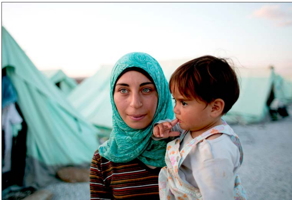
A mother and her child in the Softex refugee camp in northern Greece in 2016.

In the face of an increasingly hostile climate for “people on the move,” GWBF is finding that there is a greater interest in engaging, particularly among individual donors but also among some family foundations and institutional donors.