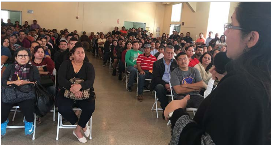
Attendees listen to a presentation about the Central American Minors (CAM) program expansion.