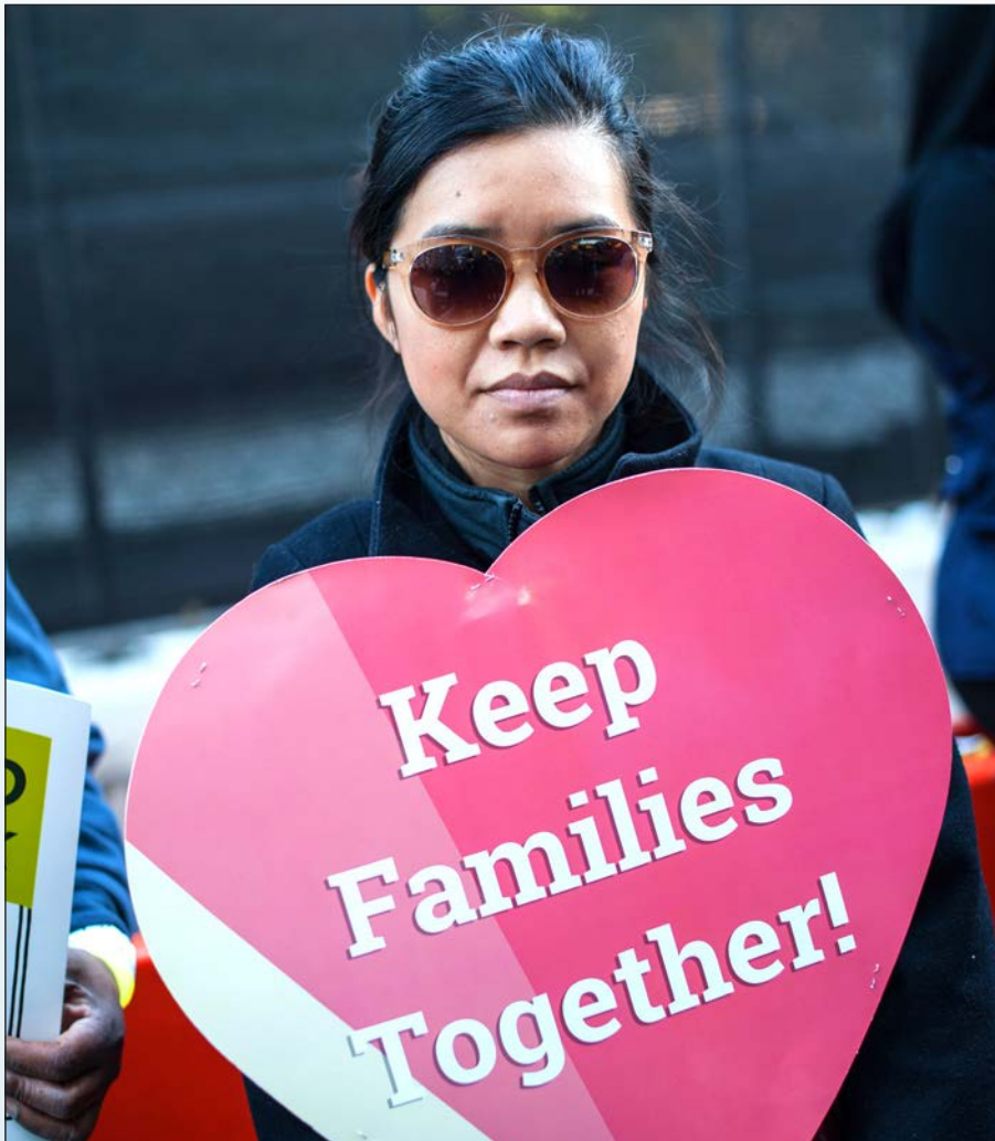
A participant at a November 2016 immigration rally in New York City.