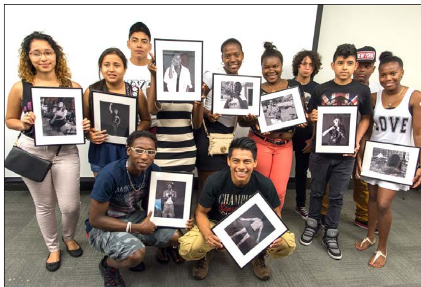
Unaccompanied immigrant youth participating in Terra Firma’s Youth Enrichment Program on their final day of photography class.

New Federal Policies Put Additional Strain on Local Foundations. Robin Hood’s strategy of solving intractable problems by investing in organizations and programs with proven track records of success is working, but is facing significant headwinds as a result of new federal public policies that are putting more immigrants into legal limbo and creating tremendous uncertainty about the use of public benefit programs. These policies are further impoverishing immigrant and asylum-seeking New Yorkers. In this difficult environment, local foundations like Robin Hood, in partnership with local and state governments, will need to develop new means of mitigating those adverse consequences and identify new levers to achieve positive outcomes.