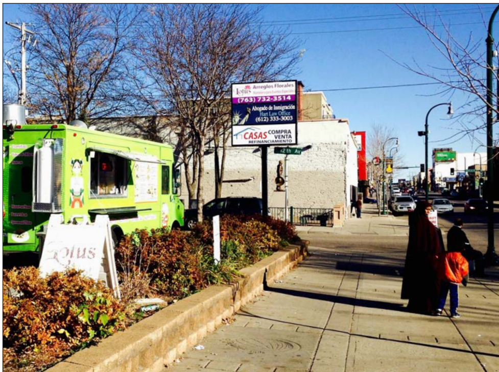
A woman wearing traditional Somali clothing near a Mexican food truck in Minneapolis, Minnesota.