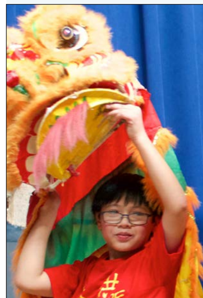
A traditional lion dance is performed as part of Chinese New Year celebrations in Philadelphia.