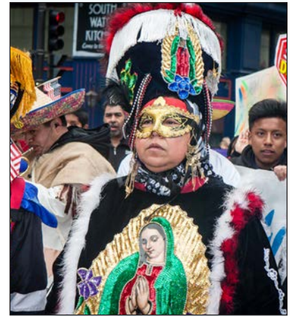
Chicago's Cinco De Mayo parade participants calling for immigration reform and workers' rights.