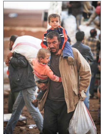
Syrian refugees who escaped from Kobane walking on Turkey-Syria border in Suruc. Sanliurfa, Turkey, May 2014.