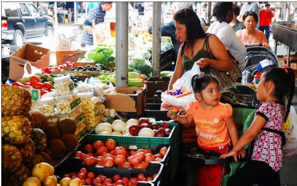
A mother buys produce at the Italian Market in Philadelphia, Pennsylvania.

anchoring the local community. By the end of 2017, Fels had made nearly $700,000 in grants to support immigrants and refugees in Philadelphia through its Focused Populations portfolio. Approximately half of the support was directed to refugees, 1 and most of the other grants served a mixed immigrant, refugee, and asylum seeker population. Additionally, some of the Arts and Culture grants also benefit refugees and asylum seekers. 2