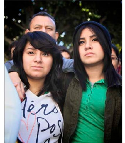
Unaccompanied children from Central America who received support from St. John’s Well Child and Family Center in Los Angeles, CA.