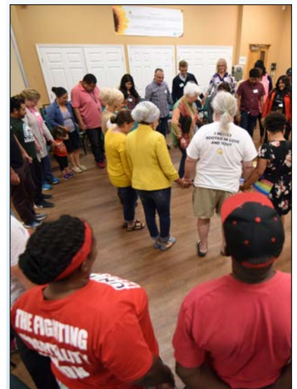
Regional membership meeting of the Florida Immigrant Coalition (FLIC).

While legal categories such as “refugee” or “asylum seeker” or “migrant” determine people’s trajectories, the human faces and experiences of these people make the distinctions unproductive for programming, strategy, and advocacy.