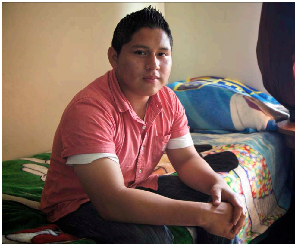
Unaccompanied child from Central America who received support from St. John's Well Child and Family Center in Los Angeles, CA.