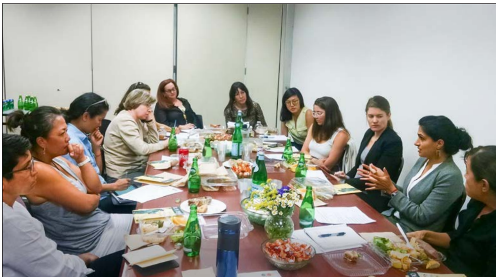
As ICE increases enforcement operations in California, our site visit to the West County Detention Center in Richmond (in partnership with the Bay Area Legal Services Funders Network) gave funders insights on living conditions, the impact of family separation, and the dire need for legal representation for immigrant detainees.