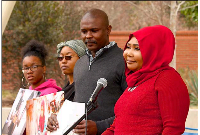
Sudanese refugee sharing her story during a rally held at the one-year anniversary of the first executive order, featuring refugees speaking about its impact, and with support from City leaders.

By 2017, Unbound identified strategic actors in the field who were interested in working across silos to build meaningful partnerships aimed at both rallying public support for refugees and strengthening the voices of refugees and their allies. The 2017 U.S. grants portfolio focused on refugees and asylum seekers totaled nearly $460,000, a level likely to be maintained in the near term. The larger grants were to CWS, to train refugee leaders in community organizing, storytelling, and leadership for social change, inspired by the trainings that helped the DREAMers so successfully tell their stories to the public, and to a new national coalition and campaign called We are All America, based at the National Partnership for New Americans. This campaign was launched to strengthen welcoming efforts for refugees and asylum seekers nationally, grounded in state-level campaigns. Unbound also supported the campaign's work in Florida and Tennessee with grants to the Florida Immigrant Coalition and the Tennessee Immigrant and Refugee Rights Coalition, and provided matching funds for a project in Arizona. 4