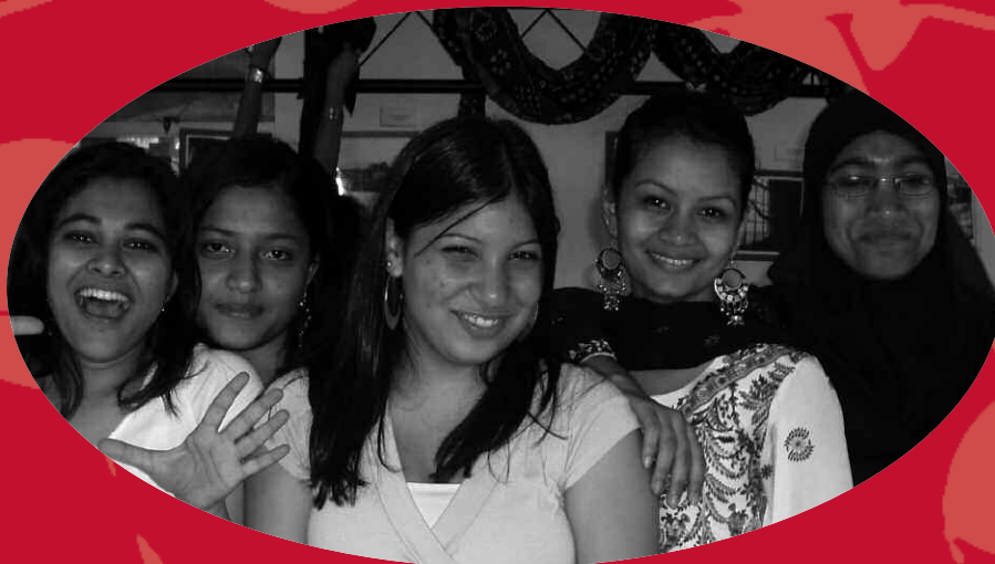
South Asian Youth Action (SAYA!)

All grantees were asked a series of questions intended to assess the following issues: the overall success of their capacity-building projects; satisfaction with the funding process; and quality and impact of consulting services provided by CRE and FMA. Depending on the nature of their projects, grantees were then asked to answer specific questions related to the progress of their particular project: fundraising, fiscal management, leadership development, technology, and/or program development. Most projects